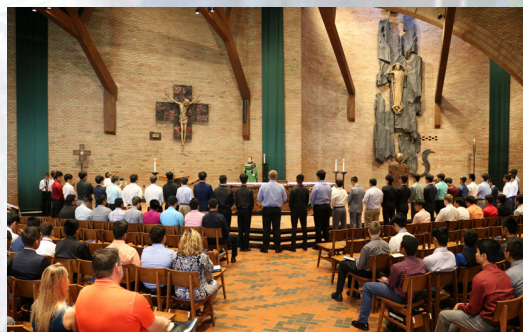
Members of the junior class are installed as Ministers of Hospitality.