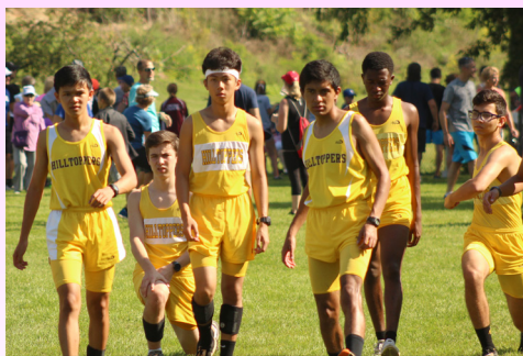
Varsity Hilltoppers warm up before the race.