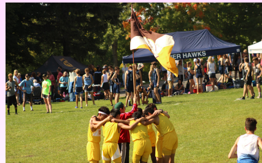
Hilltoppers hype up before the start of the race.