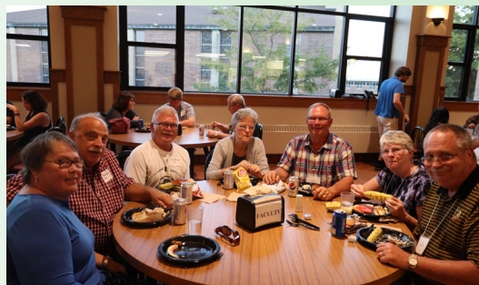
Alumni enjoy the picnic dinner in the refectory.