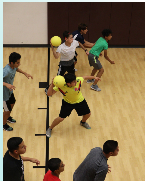
Sophomores compete in a game of dodgeball.

Afterwards, everyone on campus was invited to a picnic style dinner that was served in the refectory. Here both students and faculty were able to kick back, relax, and enjoy the freshly grilled food. Freshman Shue Yang said, "I thought the Labor Day activities we did were fun. I also liked the food because it was something different." Whether it was taking a break from school or simply having time off from everyday activities, everybody was able to have a great Labor Day celebration.