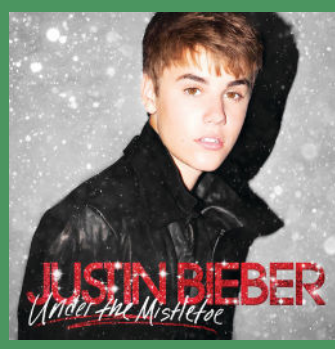
Mistletoe by Justin Bieber