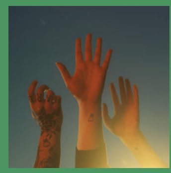
Without You Without Them by Boygenius