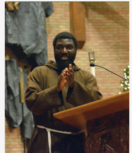
WE ARE GATHERED HERE.