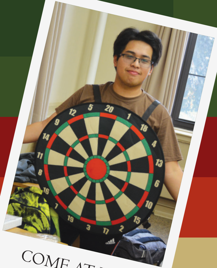
COME AT ME!