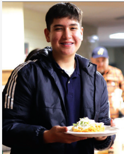
THIS FOOD IS IMMACULATE!