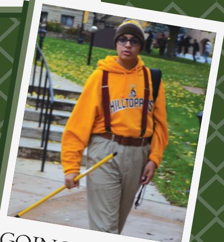
GOING TO DORM