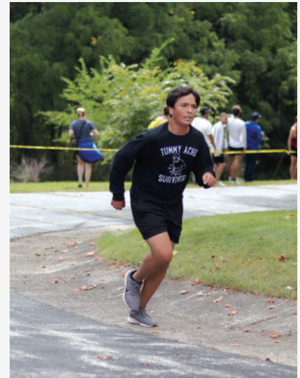
Tummy Ache (and Bertha) Survivor