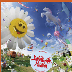
God of Music by SEVENTEEN