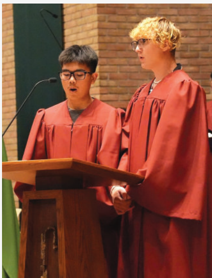
How many more verses?