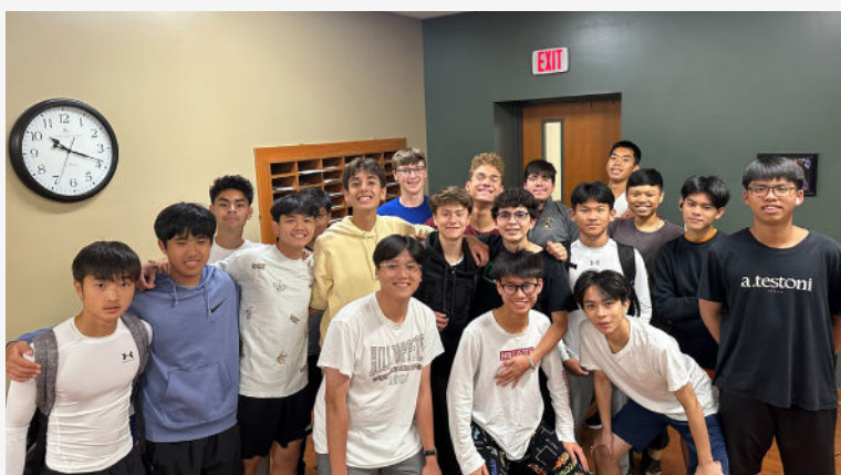
New Home and New Friends