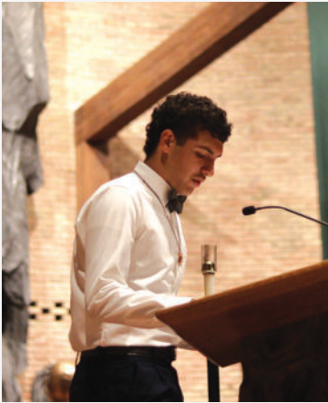
It's so dark