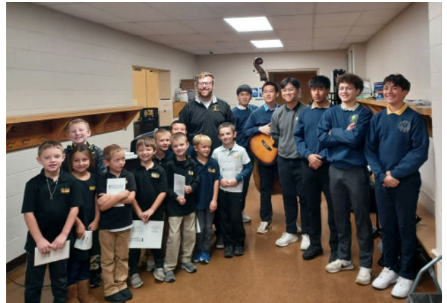
Look at the camera!