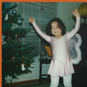
A Very Laufey Holiday by Laufey