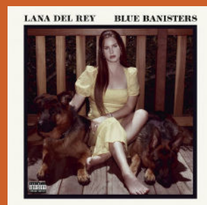
Blue Banisters by Lana Del Rey