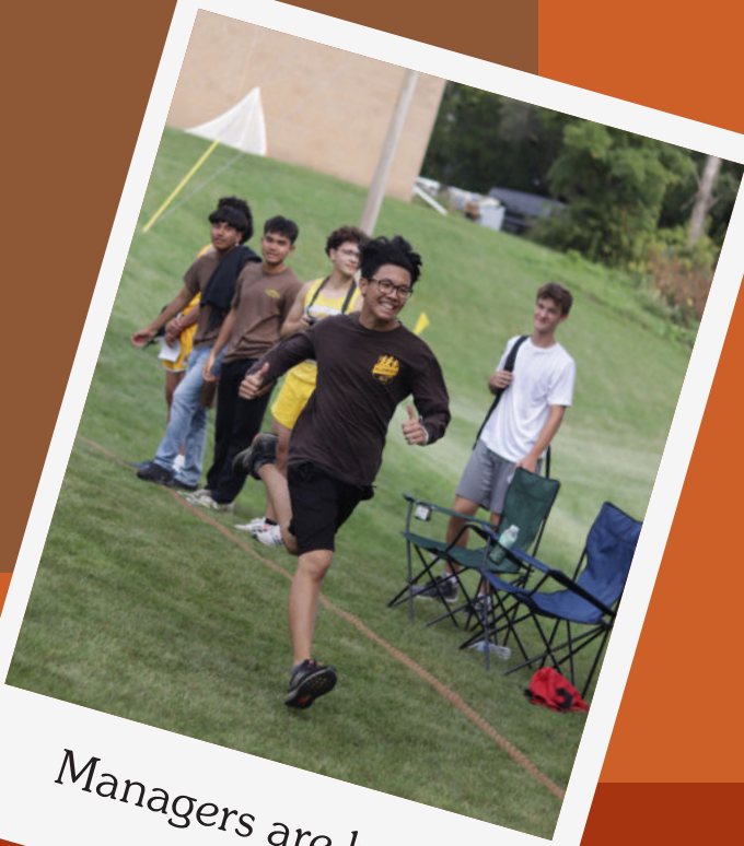
Managers are better!