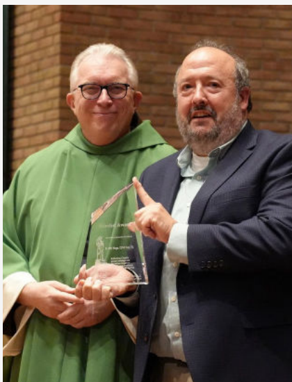
Brindisi Award 2023!